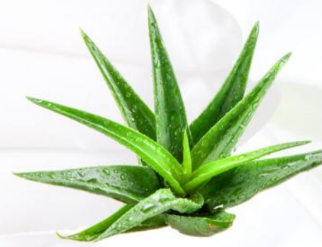
Organic clinical grade adaptive Aloe Vera