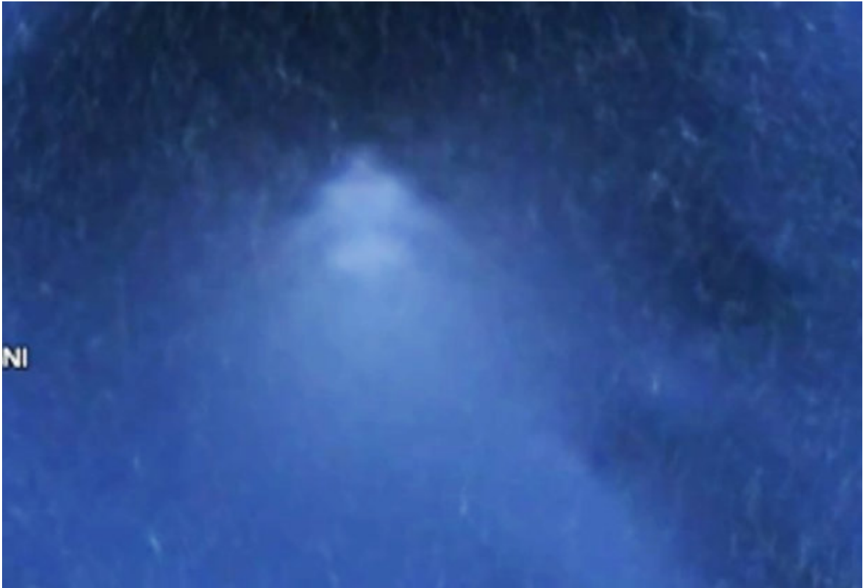
GOOGLE UFO? The finder reckons the huge mass could be an alien craft

Yet one viewer posted under the YouTube video, reported by the Daily Express , that there was no evidence it was anything more than an undersea mountain.