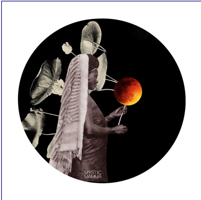
ART BY MYSTIC MAMMA

http://www.mysticmamma.com/full-moon-lunar-eclipse-in-leo-january-31st-2018/