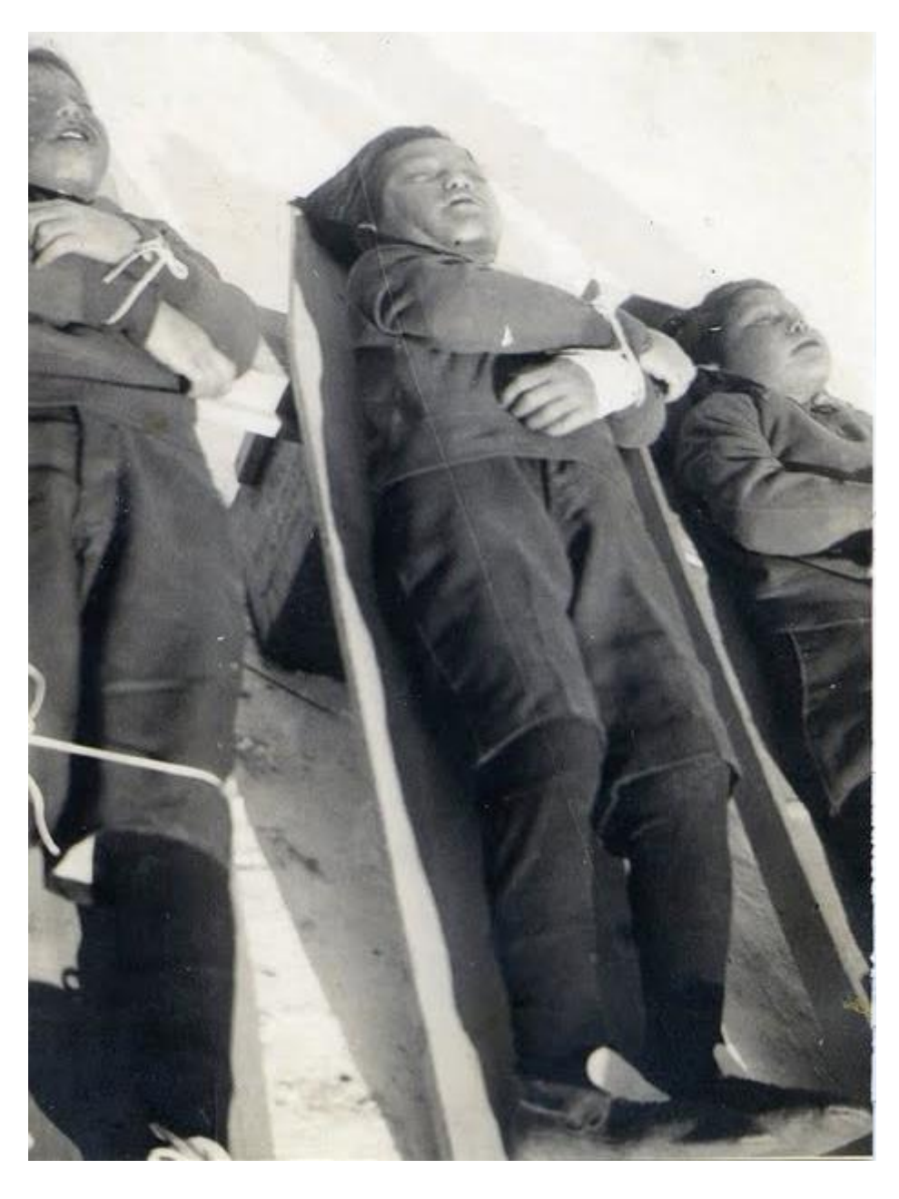
A staged photo of three native boys killed at the Catholic Lejac 'residential school' January 1937