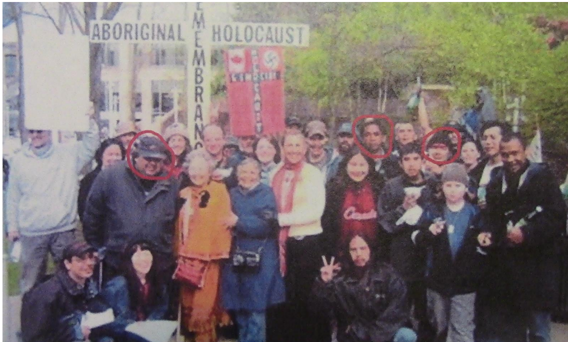
The first Aboriginal Holocaust Remembrance Day, April 15, 2005, Vancouver

Murdered eyewitnesses to genocide are (left to right, circled in red)